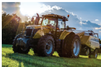
MT 500E Series (110-195 PTO)