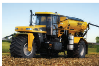
Terragator applicator TG Series