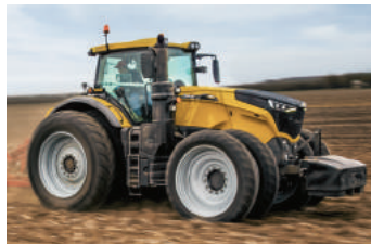
MT 1000 E Series (440-585 hp)