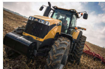
MT 600E Series (205-290 PTO)