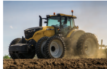
MT 1000E Series (396 to 517 hp)