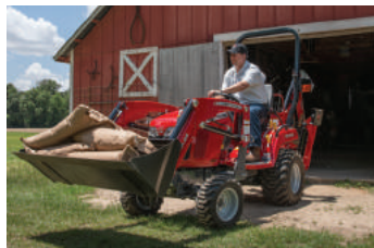
1700 Series (22-59 hp)