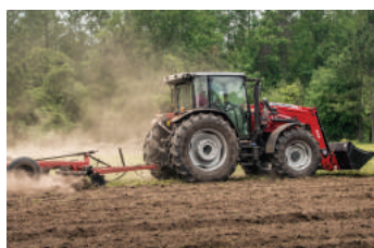
6600-6700 Series (115-160 hp)