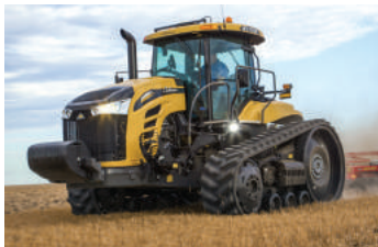
MT 700 E Series (350-400 hp)