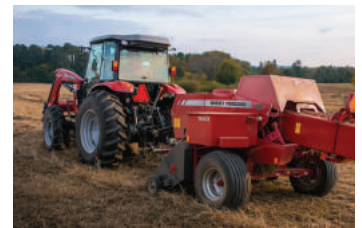
4600-4700 Series (74-101 hp)