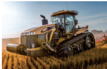
MT 800 E Series (365-425 hp)