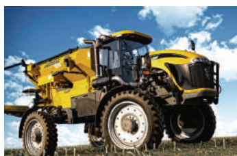
Rogator RG Series AG Chem product sprayer