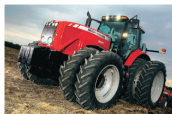
7700-8700 High Horse Power Series (140-370 hp)