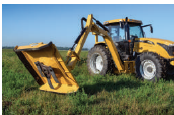
Rear Cradle Boom Mowers