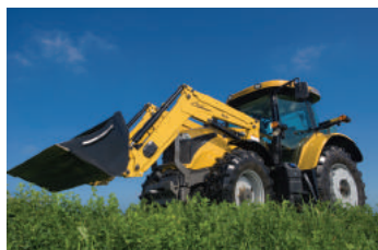
MT 400 Series (105-120 PTO hp)