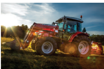
5700-6700 Series Mid-Range (90-160 hp)