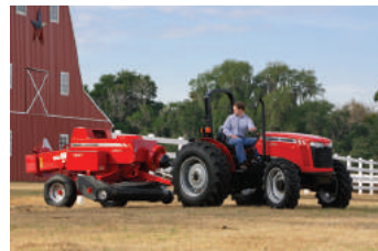
2600-2700 Series (45-74 hp)