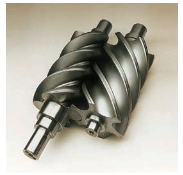
Rotary Screw Compressor by Sullair The pioneer in Rotary Screw Technology.

The user friendly Control Panel (housed in a weathertight enclosure) provides real time system information.