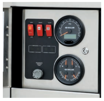
Monitoring and Control System

The Brains of the system monitors every aspect of the compressor and engine.