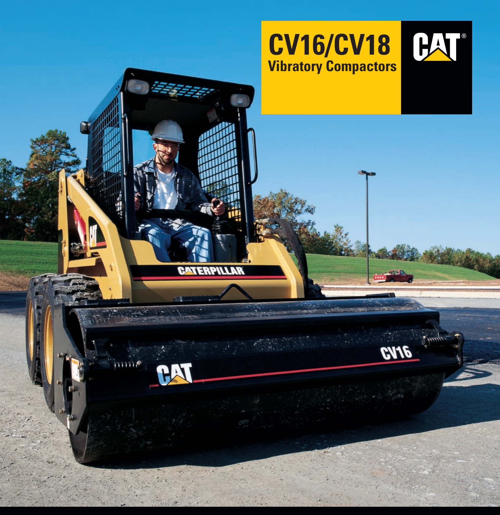
Skid Steer Loader Work Tools