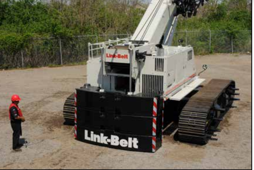
Fast, easy counterweight removal