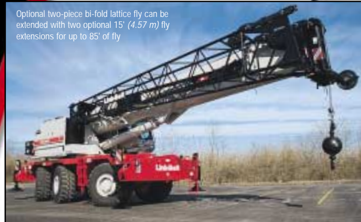
Optional two-piece bi-fold lattice fly can be extended with two optional 15' (4.57 m) fly extensions for up to 85' of fly