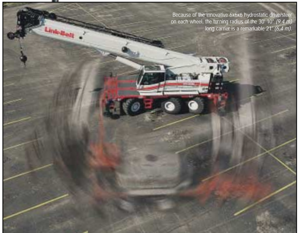
Because of the innovative 6x6x6 hydrostatic drive/steer on each wheel, the turning radius of the 30' 10" (9.4 m) long carrier is a remarkable 21' (6.4 m).

Not only is the RTC-80100 Series II easy to get from jobsite to jobsite, it also has extraordinary creep control and jobsite maneuverability, thanks to its hydrostatic powered motors in each wheel. With the smaller tires giving it an overall height of 12' 2.5" (3.72 m), along with its' individual six-wheel hydrostatic drive, there is no crane in the world, any size, that can come close to the job site maneuverability and performance of the RTC-80100. On the job, the RTC-80100's outstanding pick and carry capacity coupled with its long reach, maneuverability, incredible gradeability and low height make it truly an ideal solution for industrial sites.