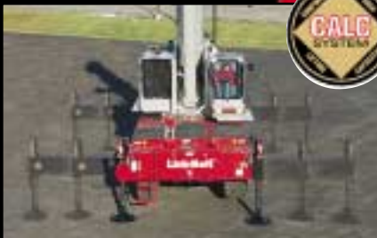
Three position outrigger beams extend to 22' 6" and retract to 9' 7" with use of hand-held outrigger controls