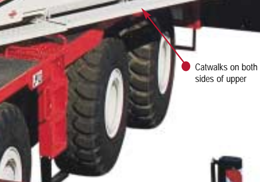
Catwalks on both sides of upper