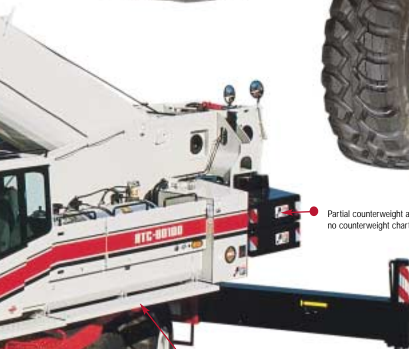
Partial counterweight and no counterweight charts